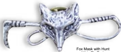
Fox Mask with Hunt Whip Tie Tack

Models dressed by Showstoppers Equestrian Wear, Hunt Whips supplied by Greg Watson Showing Canes & Whips