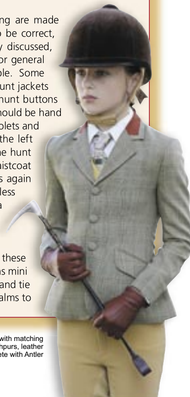
Junior with Hunt Crop. A child rider dressed in Tweed Jacket with matching fabric covered buttons, toning tie, mustard vest, mustard jodhpurs, leather gloves, carrying a Bamboo Hunt Crop complete with Antler