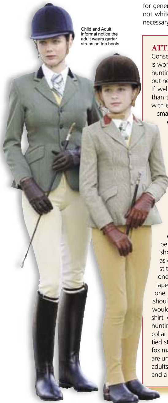
Child and Adult informal notice the adult wears garter straps on top boots

for general hunt classes any girth is permissible as long as the girth is not white. A surcingle is occasionally used out hunting and may be necessary for a larger, rounder horse and this should not be penalised.