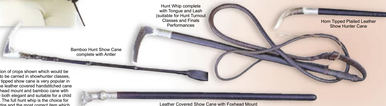
Bamboo Hunt Show Cane complete with Antler

A workman like plain leather covered or bamboo cane is acceptable as long as it is more substantial than a general showing cane. The cane for a general show hunter class may have plain brass or silver decoration but must remain subtle. Popular canes may be (and are not limited to) leather plaited with antler tipped, leather covered or bamboo horse head or fox head mounts. Obviously in turnout classes and in fact all hunter classes, a hunt whip is the most correct accessory to be carried. These may be leather covered or in wood form. The hunt whip should be carried complete with the tongue and lash attached which should be complete with a string cracker. The hunt whip should be carried correctly with the antler horizontal to the ground with the lash wrapped around the stock of the whip.