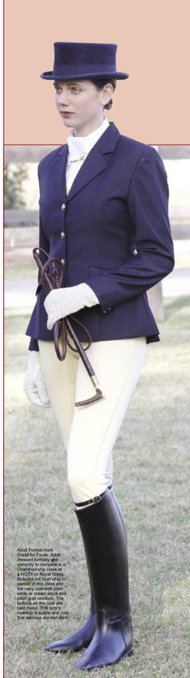
Adult Formal Hunt Dress for Finals: Adult dressed formally and correctly to compete in a Championship class at a HOTY or Royal Show. Note the full hunt whip is carried in this class and the navy coat with plain white or cream stock and plain gold stockpin. The buttons on the coat are cast metal. This lady's makeup is subtle and note that earrings are not worn.

In the writing of this article, please remember that it is a guide only with points taken from New Zealand, the United States and the United Kingdom and general common sense would certainly apply to appropriate attire for a hunter class in Australia. In regard to the issues of headwear in Australia, naturally most shows require the rider to wear a safety approved helmet and if no specification is made in regards to this in the regulations of the programme. It is then obviously up to individual choice as to what headwear is chosen. As long as a workmanlike appearance forms the basis of your turnout, and the class is not a hunt turnout class, it is doubtful you would lose a class if you chose to use or not use any of the following points.